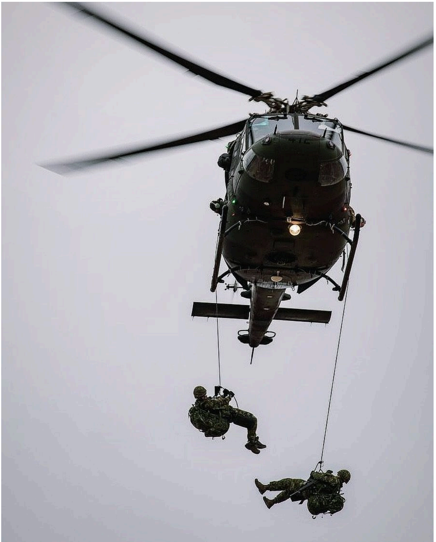
On the last weekend of the month of May, the Regiment celebrated their closest supporters during Family Day. Approximately 150 parents, children, relatives and friends descended upon