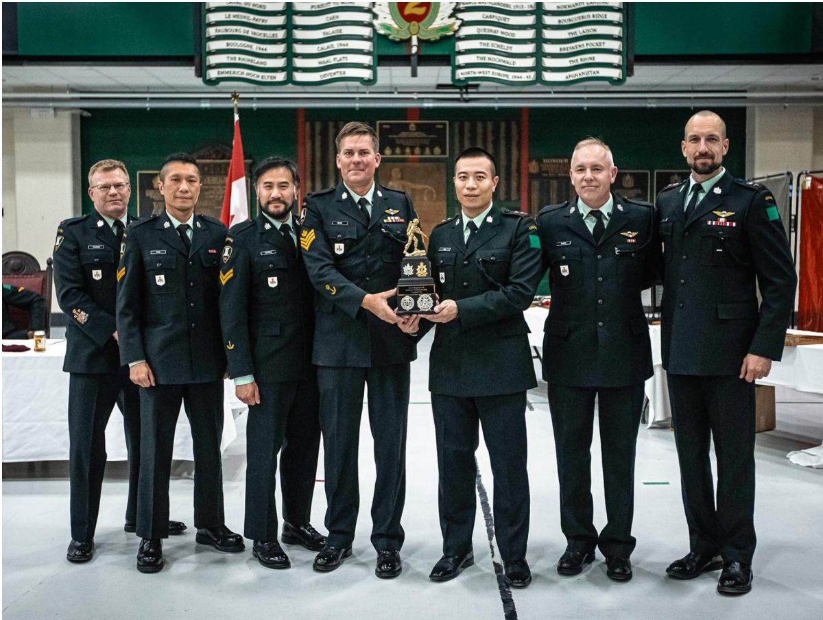
Above: The winning QOR team of the 2023 Stimson Cup.

Though training was stood-down, extra-regimental activity continued unabated.