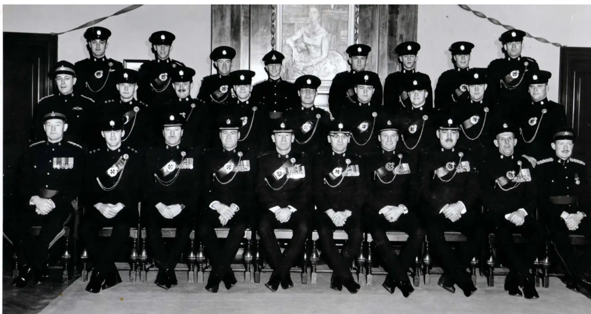
OFFICERS - SECOND BATTALION - DECEMBER 1964

You can find more information – as well as a Volunteer application form – on our museum website . Please visit our YouTube and Flickr page for the latest content.