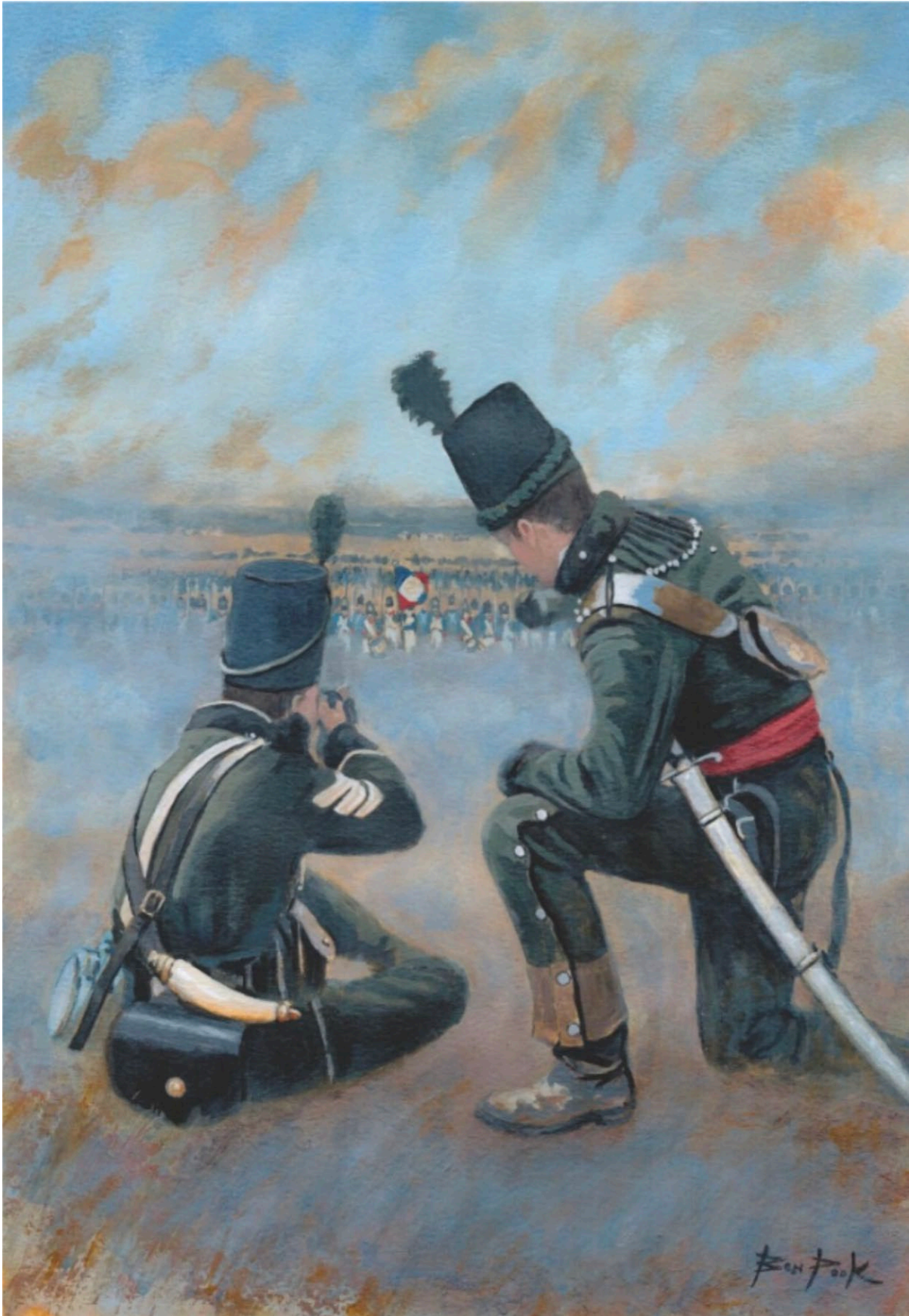
The Origin and Evolution of Rifle Regiments (3/4)