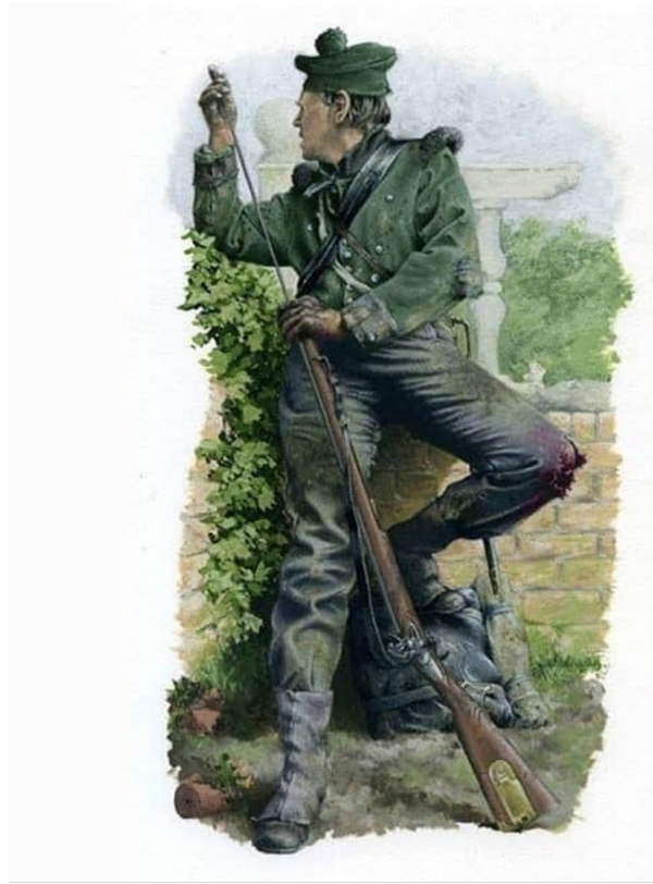
Illustration: A Rifleman in the Peninsular Campaign

considered elite and were often seen at the forefront of actions throughout the campaign, from Talavera in 1809 onward.