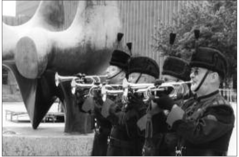
The Queen's Own Rifles buglers sound Last Post.